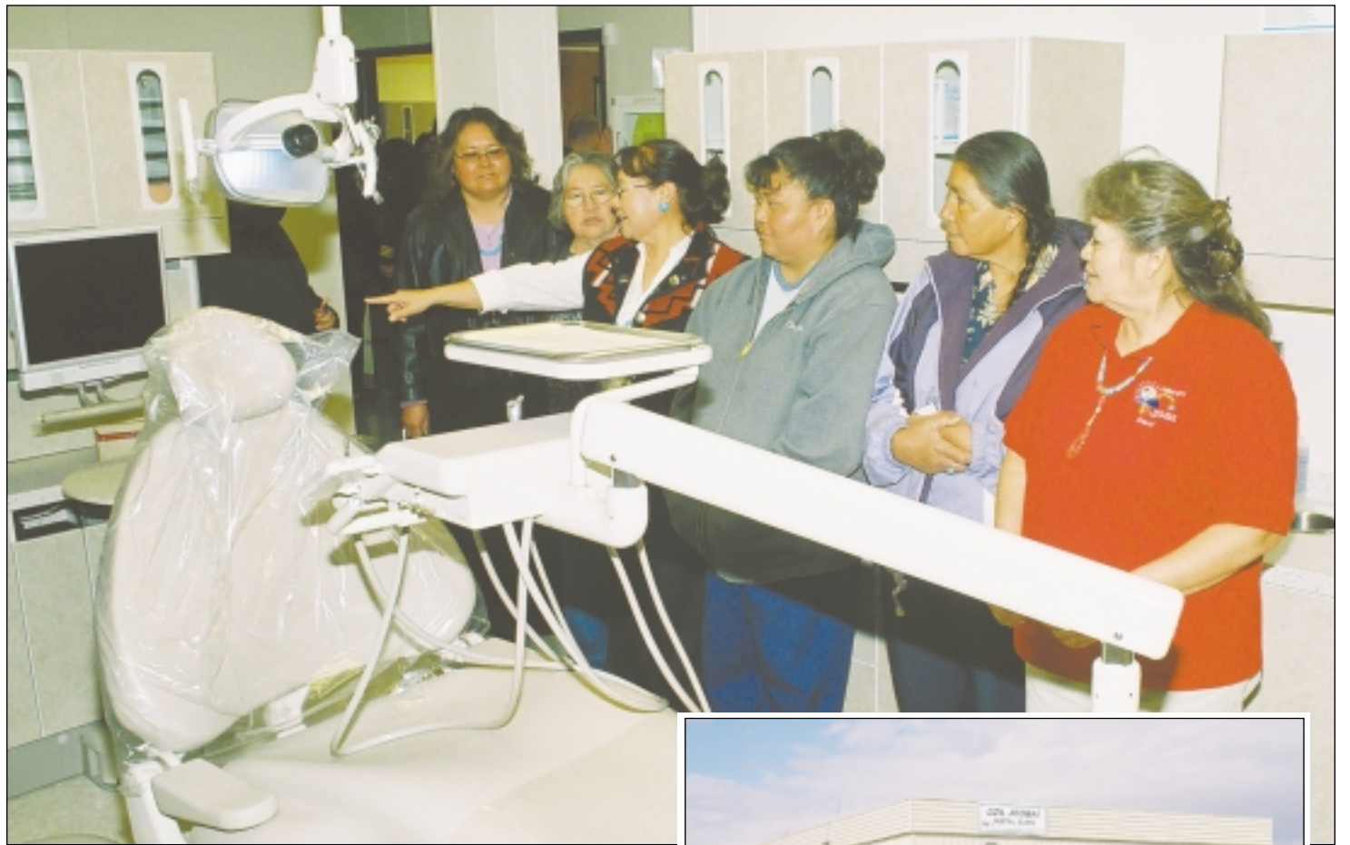
Above: TCRHCC dental staff gave tours of the new Dzil Jooba'i Dental Clinic in Cameron at the Grand Opening on January 24th. Right: The clinic, visible from Highway 89, immediately north of the Cameron chapter house and Head Start facility.